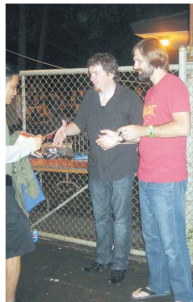
Third Day members greet a fan.

True to their Southern roots, the band then delivered a Dixieland-in-